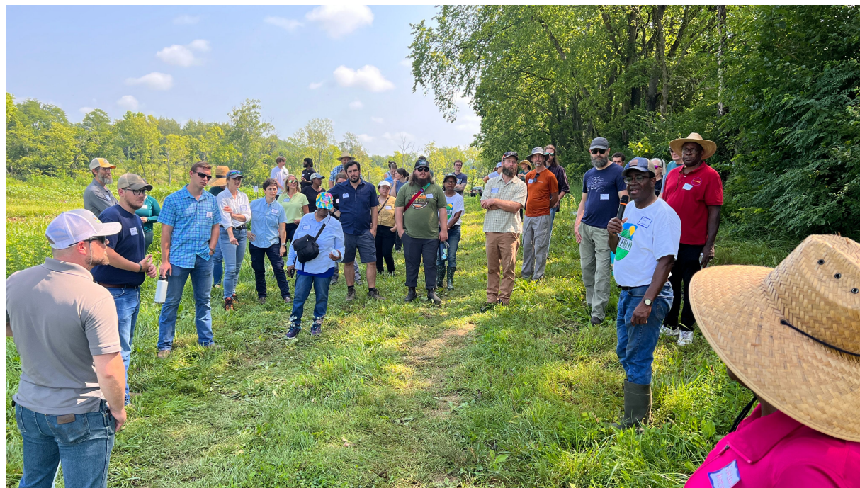
The OAK community gathers at Coleman Crest certified organic farm in Fayette County in July 2023.

Please visit our Farmer Field Days website to access summaries and resources from all eight Farmer Field Days from 2023!