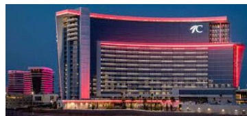
Exhibit at the 2026 NACA Annual Convention!

Check out this year's list of volunteers!